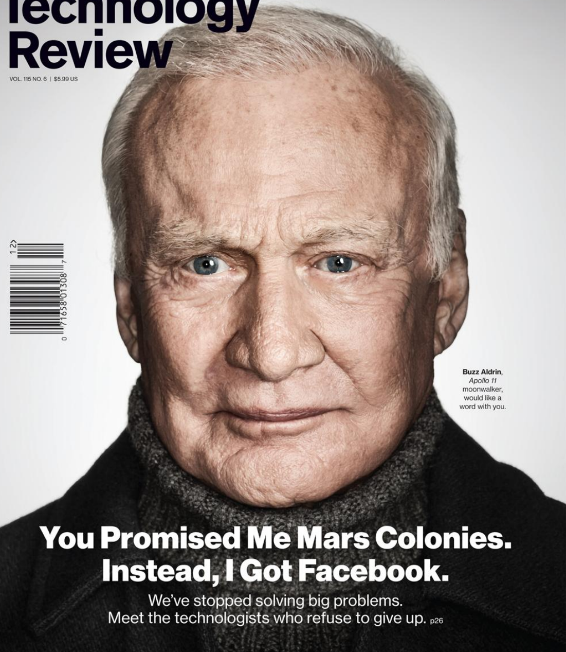
Buzz Aldrin, Apollo 11 moonwalker, would like a word with you.

You Promised Me Mars Colonies. Instead, I Got Facebook.